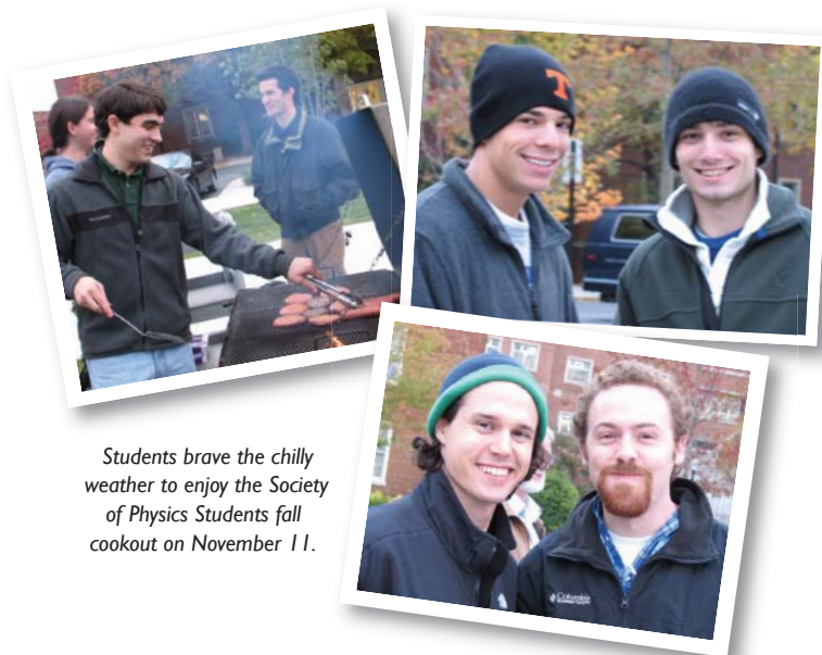
Students brave the chilly weather to enjoy the Society of Physics Students fall cookout on November 11.